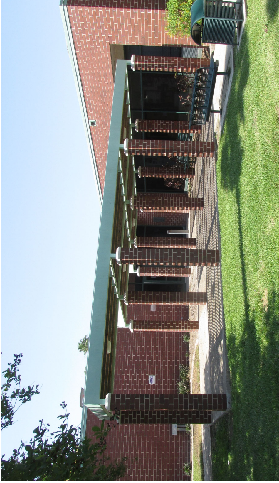
Pecan Campus Arbor Brick Repair and Replacement