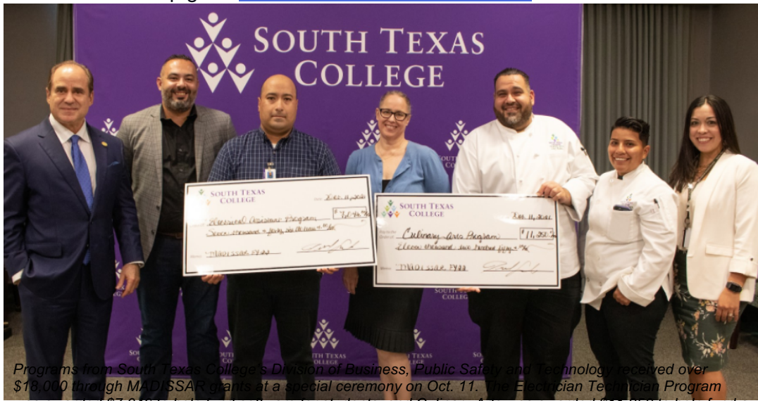
Programs from South Texas College's Division of Business, Public Safety, and Technology received over $18,000 through MADISSAR grants at a special ceremony on Oct. 11. The Electrician Technician Program was awarded $7,046 to help fund software for students, and Culinary Arts was awarded $11,250 to help fund a Student Success Mentoring Program.

and Effort reporting. Each session focuses on one of the GPA Competency areas for Grant Writing Professionals. By participating in this training staff integrate what they learn into their work to support college faculty and staff when collaborating with them to develop grant proposals. For more information on GPA membership go to Grant Professionals Association .